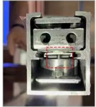
Track lock Can lock the door inside