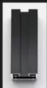
Matte black frame