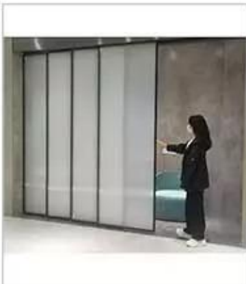
It will bounce back when encountering obstacles safe for the elderly, Child