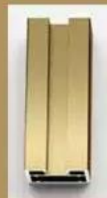
Golden frame meeting room