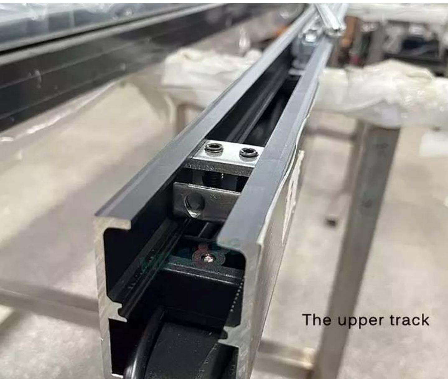
The upper track