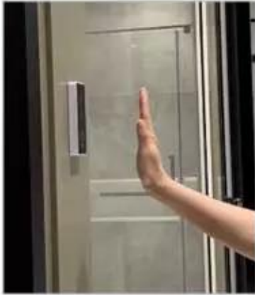
Sensor to open the door