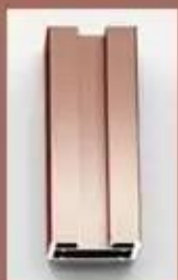
Rose gold frame