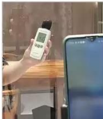
Muting when close and open the door