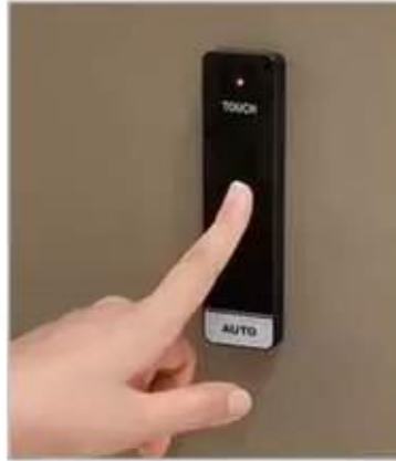
Press button Press the button for 5s the door open all time