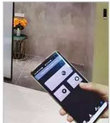
Can use the phone App to debugging the door